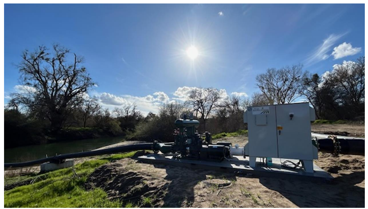
More power! The North pump station at full tilt while the fields can take more

Petersen came offline for the season last week. Staff will prepare a back of the napkin estimate of the projects recharge for Board discussion.