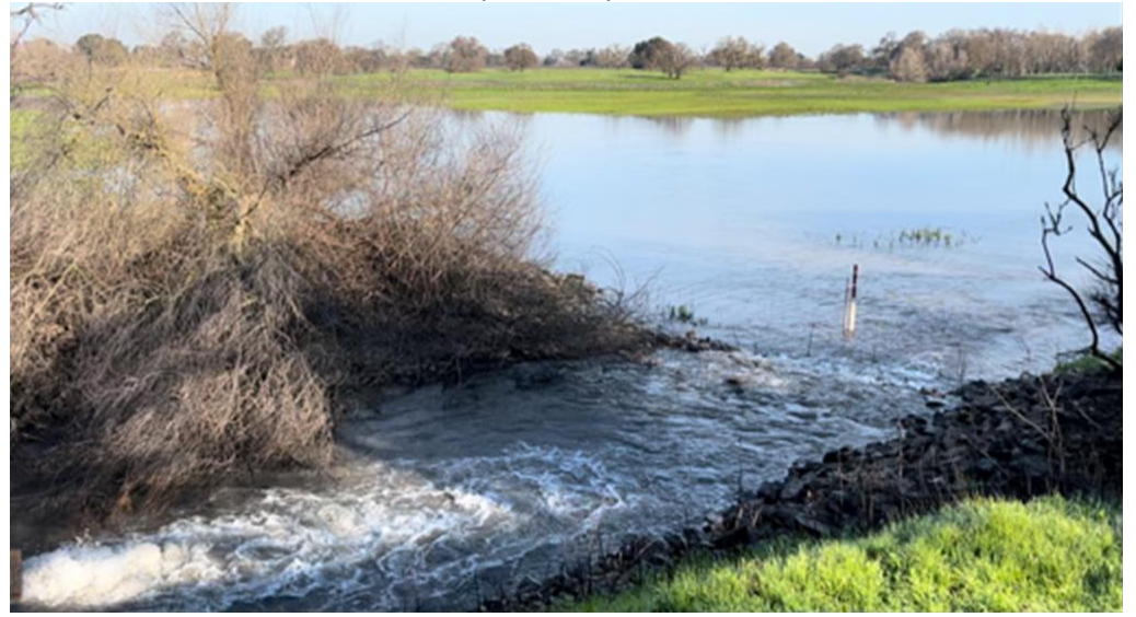
District Staff started the Spring Tracy Lake Fill on Saturday Afternoon

Operations Update: Staff reached out to Tracy Lake neighbors who agreed it was time to begin the fill. EBMUD has been ordered to release flood curve flows so the river has been at over 800CFS and remains there. The Tracy Lake Pump Station came online on Saturday afternoon. The pump tripped off line early Sunday morning. A site visit found no apparent anomalies and the reset button got the system back up and running. The District Engineer surmises that the high pump rate caused the pump to lose prime so we turned the pump down to 16 CFS from 26. Staff will run it to 100CFS and evaluate whether more is possible before we reach the neck of Jahant Slough.