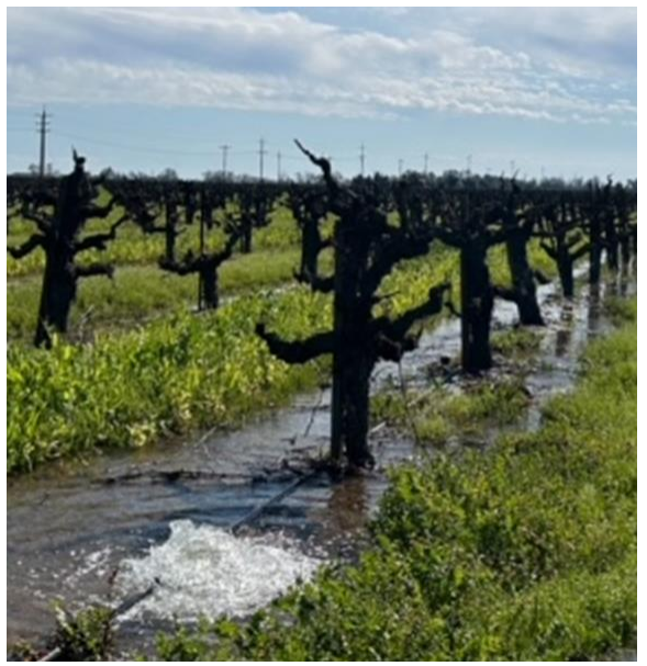
Lakso East field pruned and back in recharge

Petersen came offline for the season last week. Staff will prepare a back of the napkin estimate of the projects recharge for Board discussion.