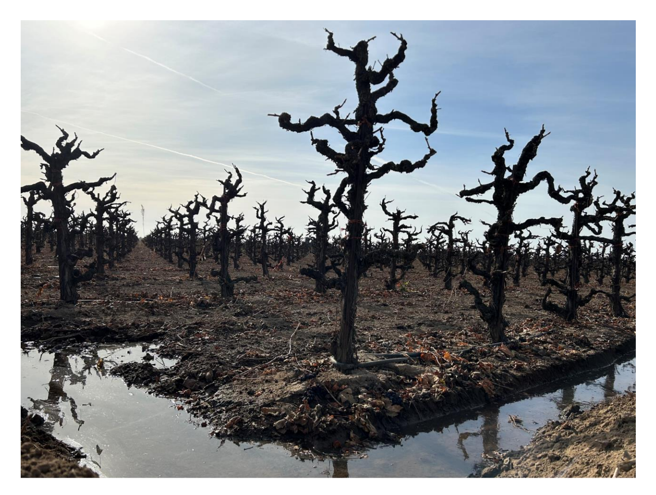
Costa Field online taking CalFed Recharge Water for recharge

Arnaudo Construction set the last of the joints for the south system phase two project today. They will be back next week to fuse the old 30-inch lines to the new 46-inch lines with a field fabricated collar. Combined with Richard Rodriguez' efforts to renew the Tecklenburg cells, and a positive forecast, staff expects to bring Tecklenburg online next week. The Lakso recharge project is also expected to come online next week with the lay flat pipe arriving mid-week bringing active winter discharge to a total of four projects!